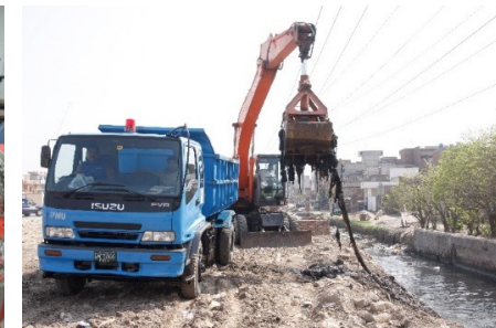
Equipment for sewerage and drainage cleaning