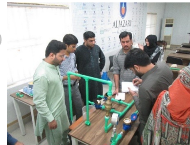
WASA and Al-Jazari Academy staff learning meter reading